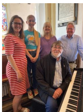
Some of our Musicians