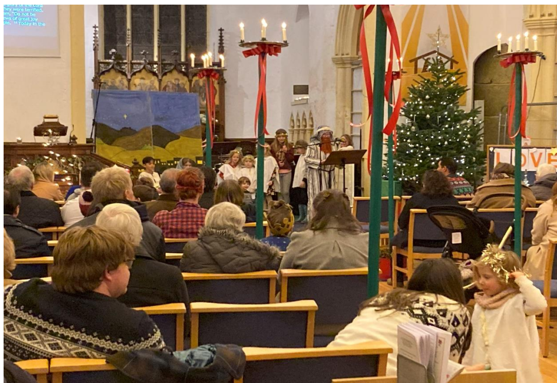
Our Christingle service.

The nearby A12 gives easy access to Ipswich, and places further afield.