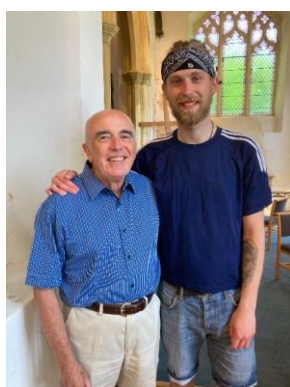
Members of our Technical Team