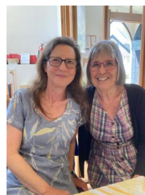
Leaders of our Ladies Group

Plus, we have a Prayer Ministry Team, a team of folk preparing refreshments, and various members of our Church Family who run our Open Pantry, Open Door and 'Oasis' Service.