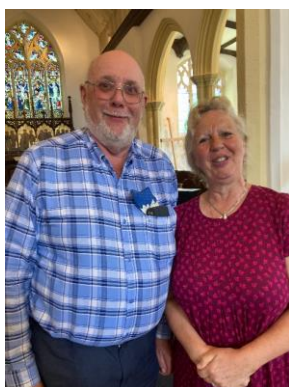
Members of our Welcome Team