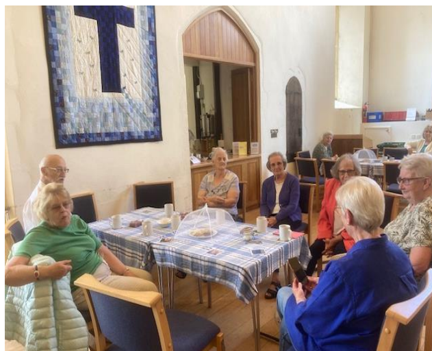
Open Door Coffee Morning

Plus, we have a Prayer Ministry Team, a team of folk preparing refreshments, and various members of our Church Family who run our Open Pantry, Open Door and 'Oasis' Service.