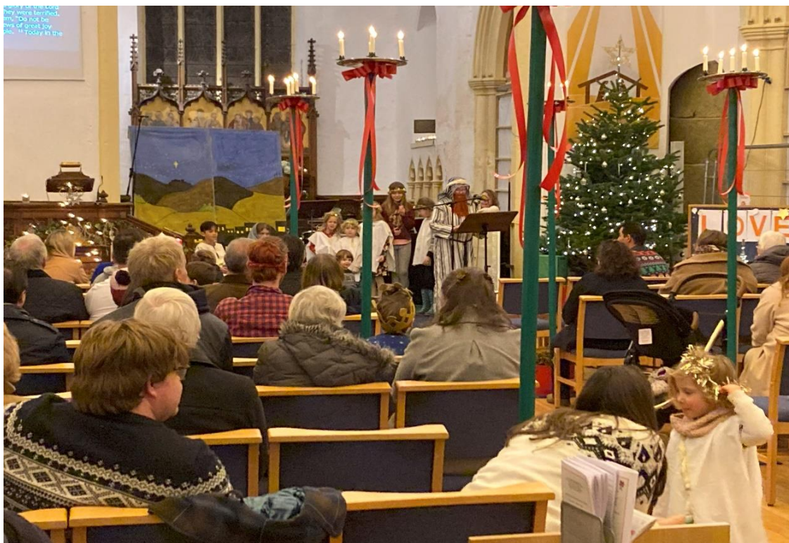
All Saints Christingle service

The nearby A12 gives easy access to Ipswich, and places further afield.