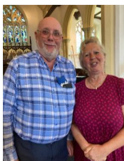
Members of our Welcome Team