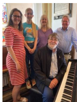
Some of our Musicians