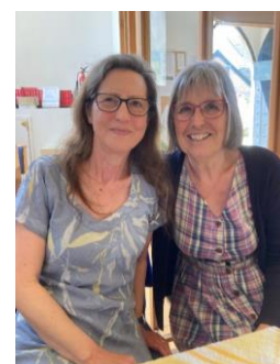
Leaders of our Ladies Group

Plus, we have a Prayer Ministry Team, a team of folk preparing refreshments, and various members of our Church Family who run our Open Pantry, Open Door and 'Oasis' Service.