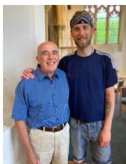
Members of our Technical Team