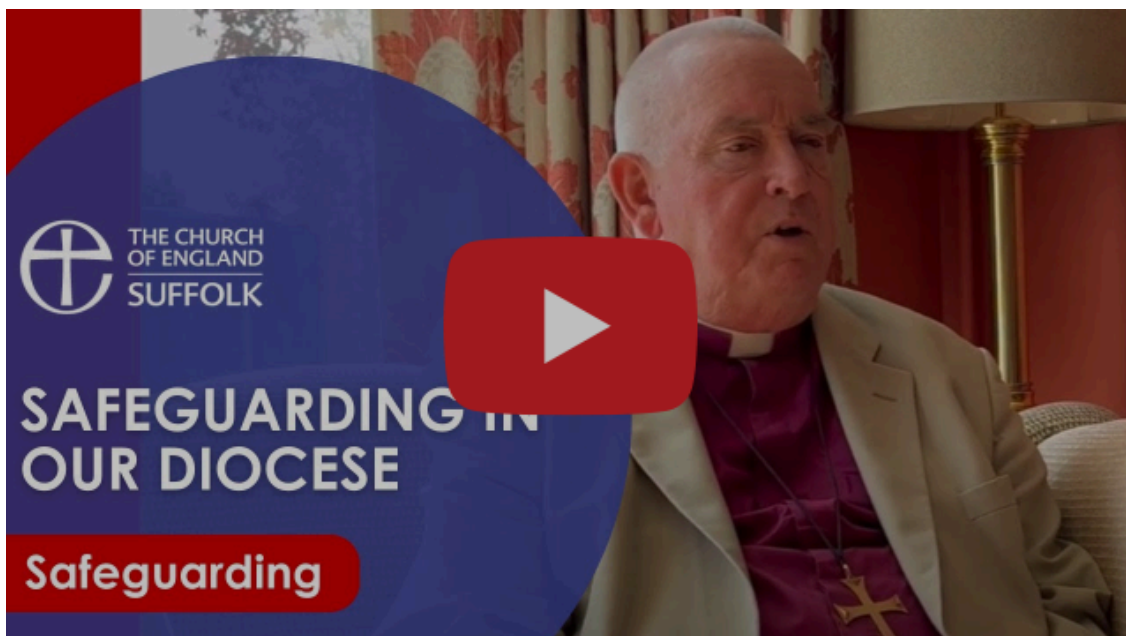
Bishop Graeme on the importance of Safeguarding

Growth Fund Opportunities: The Diocesan Growth Fund offers grants of up to £1,500 to churches to support them in implementing their Plans for Growth. Parishes are using this funding in all sorts of creative ways to take forward mission in their local communities. We'd love to receive applications from more churches, especially those who haven't applied before. To find out more about the Growth Fund visit our website here .