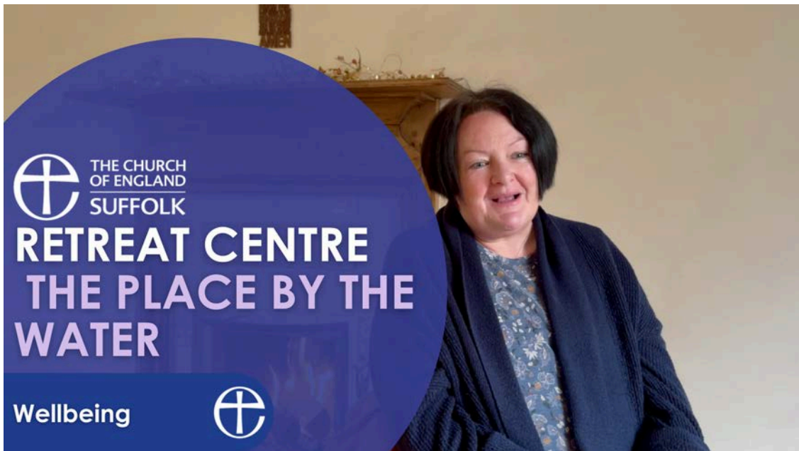
The important of well-being

To learn more or get in touch, you can reach out via their social media, email theplacebythewater@gmail.com , or visit their website at www.theplacebythewater.co.uk . For other retreat centres and information about quiet days and spaces, click here .