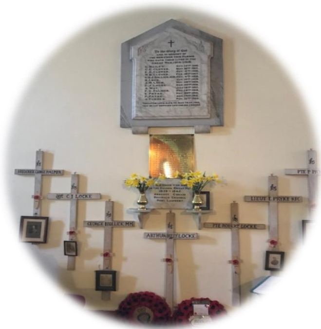
Poignant Remembrance Display at St. Matthew's