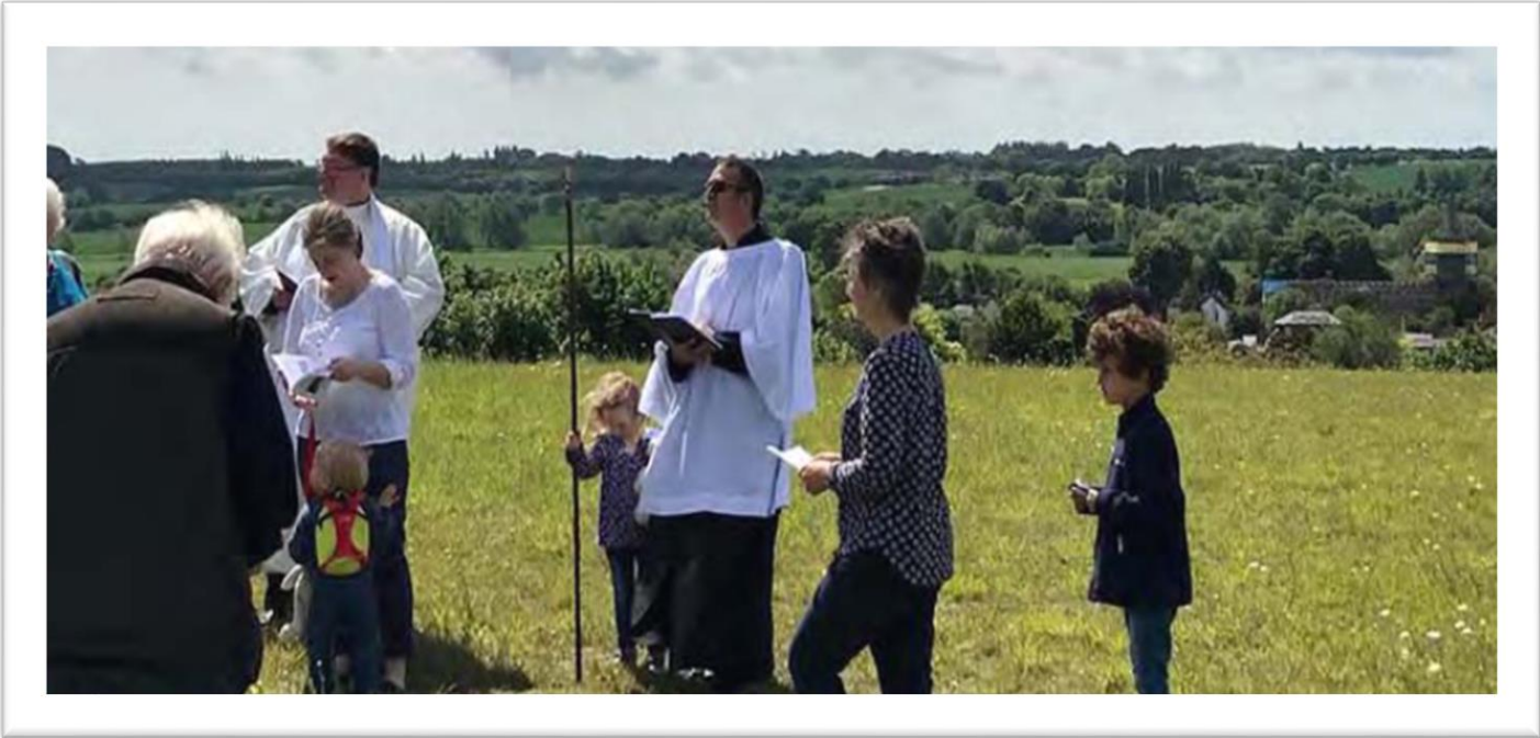
Rogation Sunday – beating the bounds!