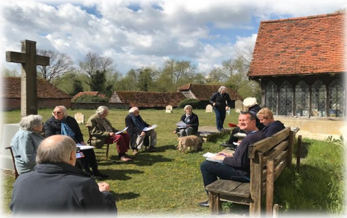
St Mary's Wiston PCC meeting held outside during lockdown, dog included! May 2021