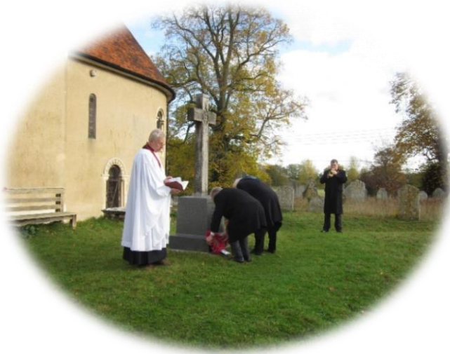
Remembrance Sunday Service – our short, but poignant, outside gathering