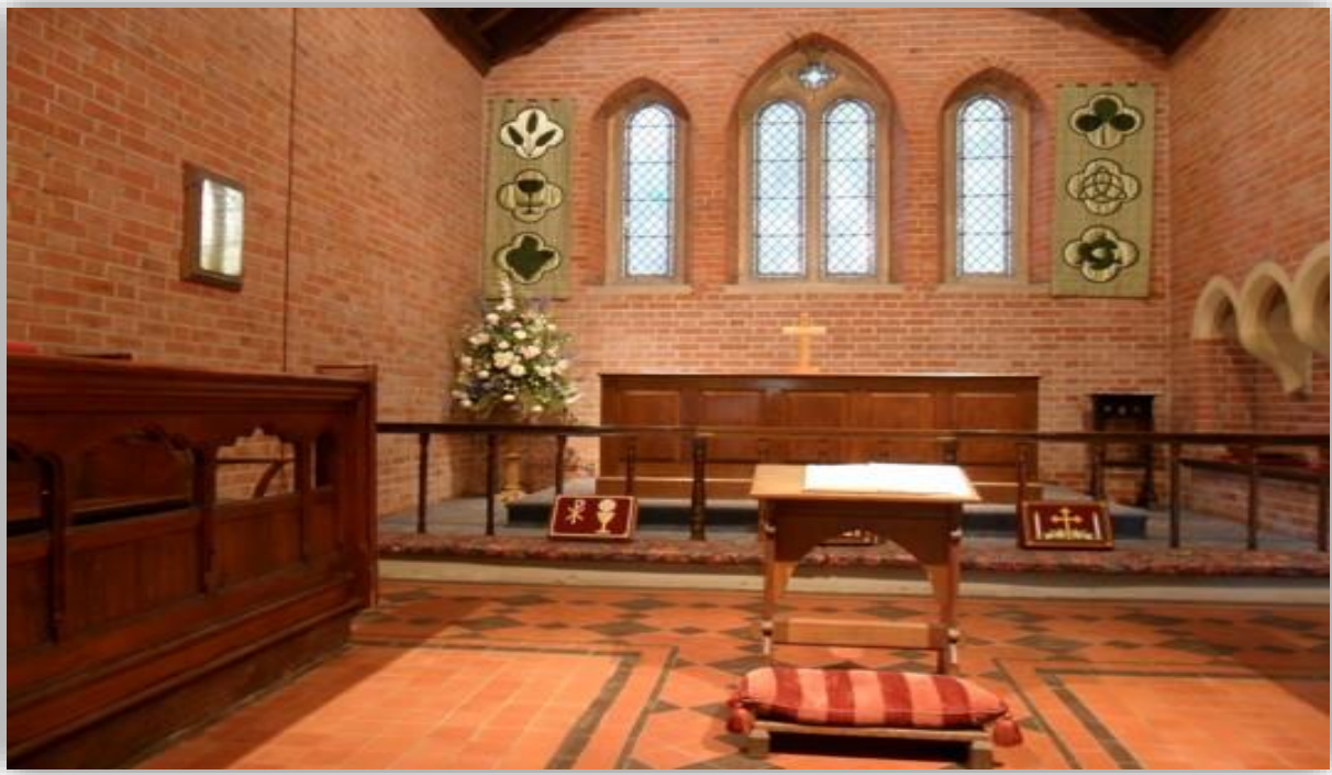
Seasonal Banners and Flowers at St. Matthew's, Leavenheath