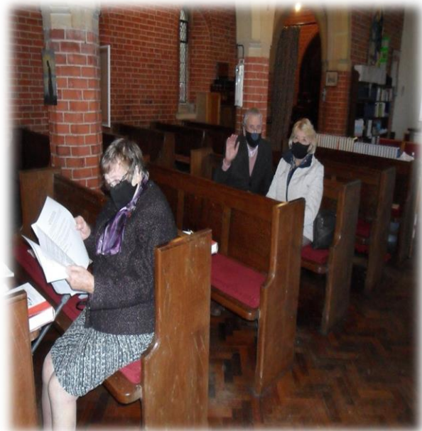
Some of the 'masked' congregation!