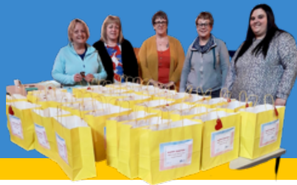
Some of our wellbeing group