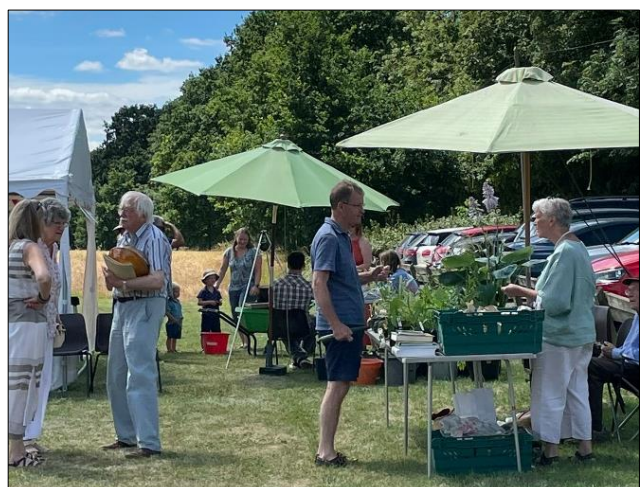
The Church Fête