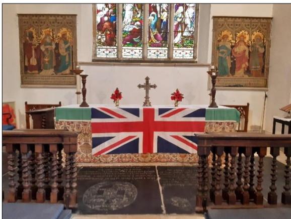
The Altar on Remembrance Sunday

The link to the Brettenham village website: http://brettenham.onesuffolk.net/