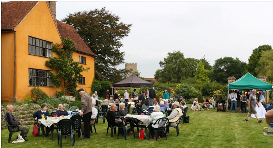
The 2021 Garden Party at Thorpe Hall

Thorpe Morieux has firm links with neighbouring villages and pupils from Thorpe attend Cockfield CEVC Primary School, going on to Thurston Community College, Stowmarket Upper School and Sudbury Ormiston Academy depending on geographic location in the village. Pupils from Old Buckenham School in Brettenham parish attend St Mary's church. Events put on by church and village hall are well attended. There is a good cross section of ages and backgrounds in the village.