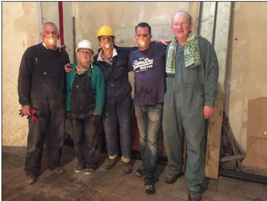
Volunteers after the first day of cleaning down the tower in 2019

The Friends of All Saints Church Hitcham is a secular registered charity supported by 140 members. In 2004 the Friends funded a major restoration of the church. In 2020 they completed the Tower Project which involved restoring and enhancing the bells, rebuilding the organ and creating a tower room with kitchenette and equal access WC. The £340k for the Tower Project was raised in just two years. Some grants required community involvement which was going well until Covid, after which we had to form a small volunteers 'bubble'. There is a strong appreciation for the church building by the villagers.