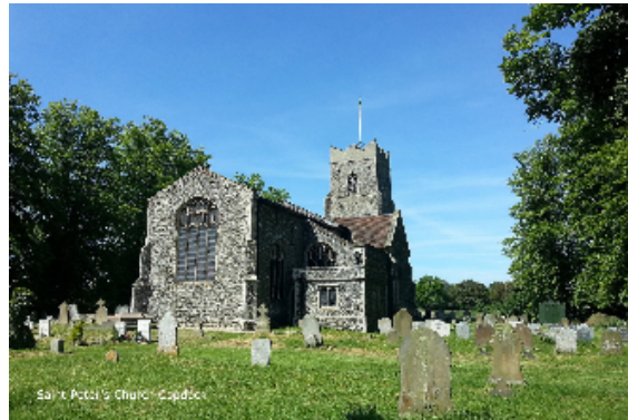
St. Peter's, Copdock with Washbrook