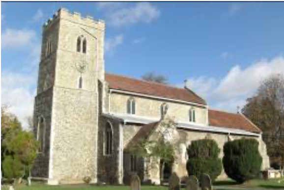
St. Mary the Virgin, Burstall