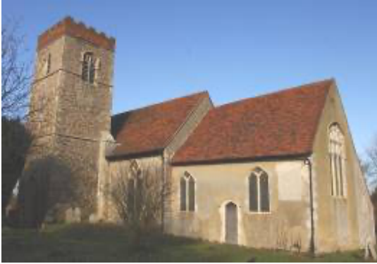
All Saints', Sproughton