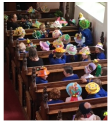
School Easter Service