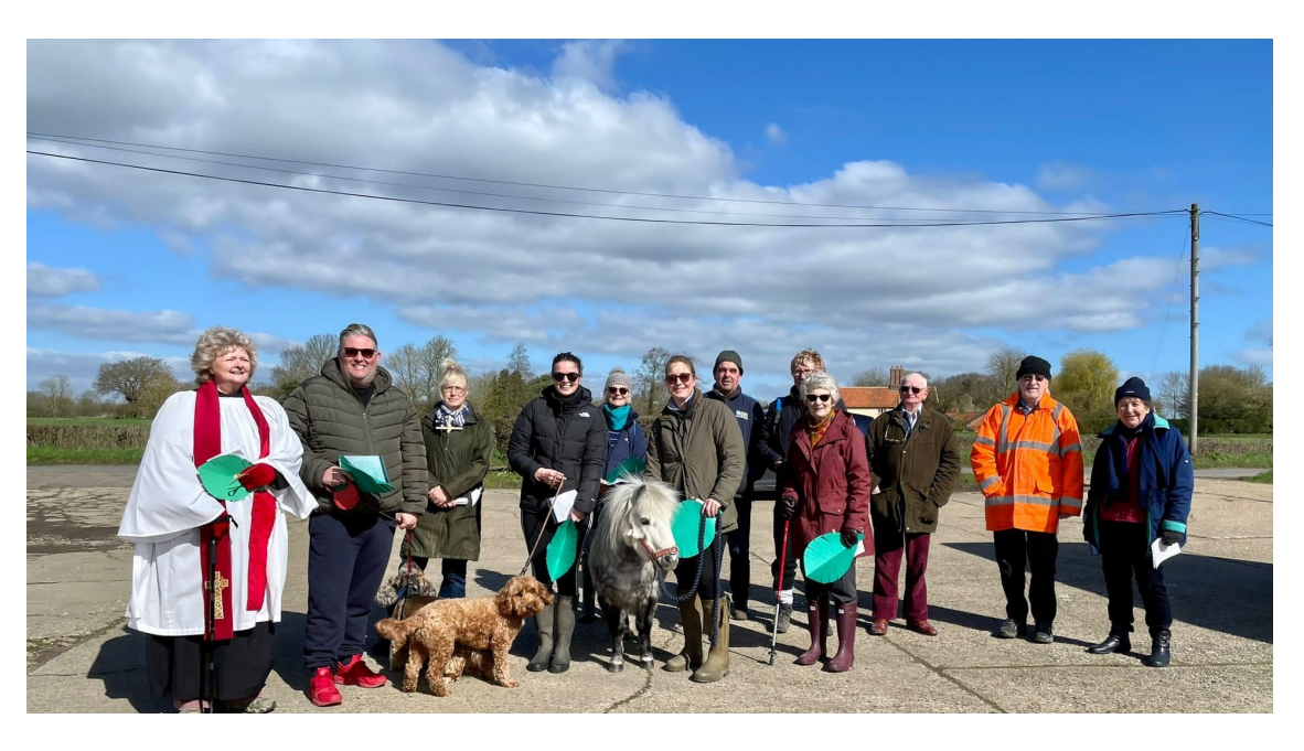
Palm Sunday - Walk and Worship

We share the diocesan Growing in God priorities. Within these we are especially keen to be Growing Younger: we wish to step up our engagement with children, young people and families so that we better reflect the age profile of our communities. We feel that working to bring children and younger adults to faith should be a top priority, especially given the presence of two church schools in the benefice. As a church we should reach out as much as possible to our communities in 'practical' as well as 'spiritual' ways and we are open to 'Fresh Expressions' of worship alongside our more traditional services. We seek to appoint a new incumbent who shares this vision.