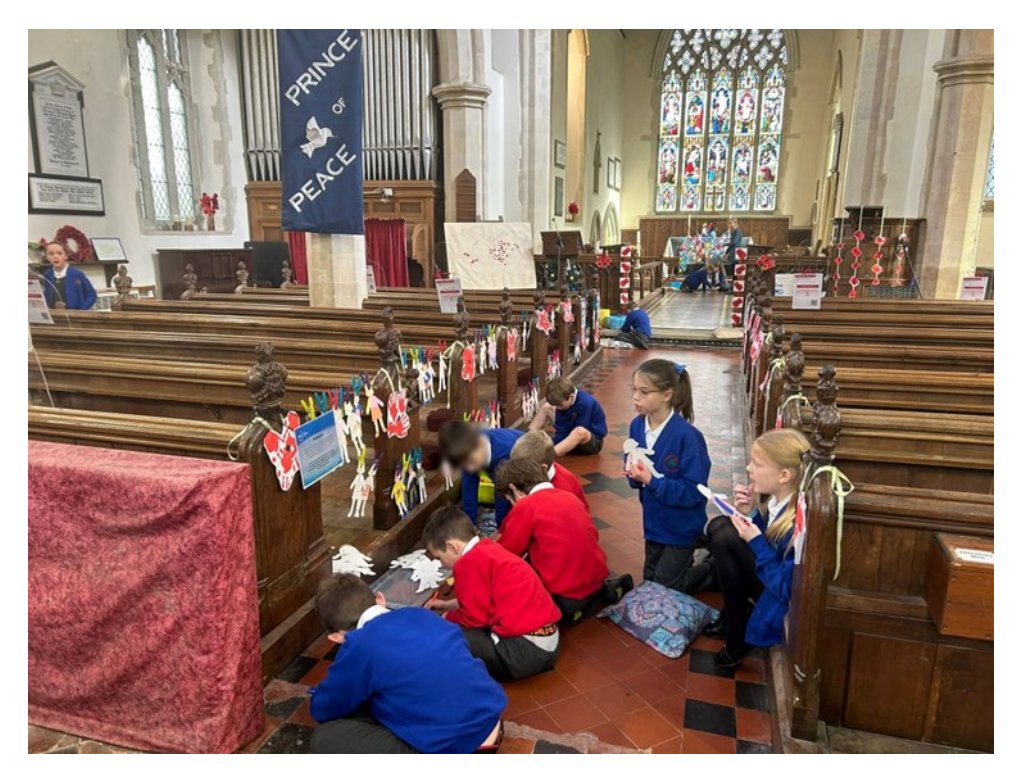
School children writing prayers during PraySpace, led by Bury Christian Youth

Our challenges are to increase regular worshippers, spread the workload over a larger congregation, aspire to the success of Mickfield Evangelical Church and Debenham Forge Community Church, increase support from Mickfield village and continue raising sufficient funds to pay the Parish Share in full.