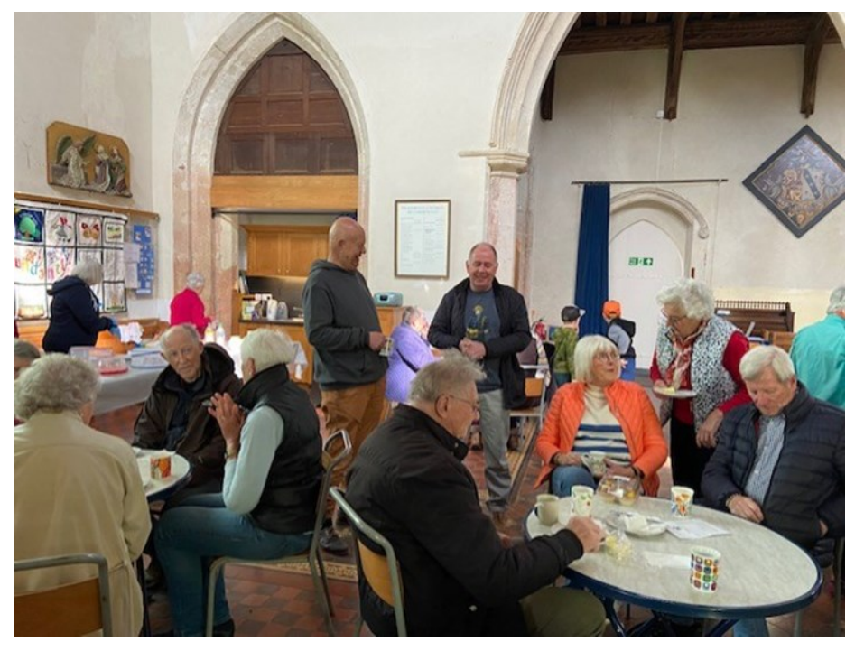
Coffee mornings are a focus of village life

The parish finances are in a good state. Contributions from regular donors by gift aid together with other offertory money is sufficient to pay day to day expenses, allowing all fund raising activities to raise money for the church fabric and for good causes. We are able to pay our Parish Share in full. Additionally, the Gardemau Church Charity provides investment income to be spent in the parish for the advancement of religion, the church fabric or in grants to the other Gardemau Charities for education and relief of the poor. We are currently making good progress with a campaign to raise £60,000 to fund masonry and window repairs.