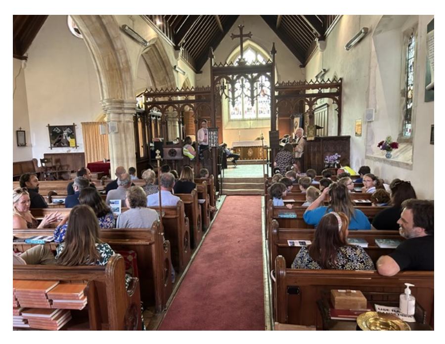
The school leavers' service

We have an excellent Church of England VAP school; staff, parents and children visit the Church for festivals and end of term services. Our Rector has a close working relationship with the school.