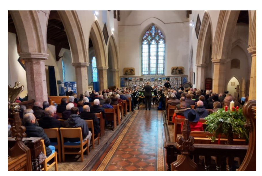
A brass band concert in Coddenham Church

The parish of Coddenham, with a population of just over 500, has a very friendly and active community. Villagers and others from the parish and beyond meet at the church, community-run village shop, country club and modern community centre as well as in the Mary Day Centre where there are twenty sheltered housing units centred on Haysel House, the former rectory. A monthly communion service is held in the meeting room there. Our dynamic Community Response Group works with the Parish Council for the benefit of parishioners and St. Mary's is very actively involved, including taking the lead in running a Baby and Toddlers group. A biennial Scarecrows and Open Gardens festival, workdays on communal areas and a wide range of other events all enhance our local community spirit.