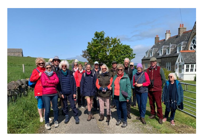
Benefice pilgrimage to Iona

Patterns of worship continue to evolve to balance needs, aspirations and resources and increasing numbers of worshippers travel across parish boundaries. Most churches have three services in a typical month, generally in Common Worship format with a few BCP services, and we join together for Holy Communion as a benefice when there is a fifth Sunday in the month. Individual parishes also combine on special occasions such as Palm Sunday, Good Friday and Rogation. A Band and a Choir draw members from across the parishes for benefice services, Christmas, Easter, Harvest Festival and Songs of Praise celebrations. Appendix 1 shows the basic monthly template for our worship in 2023. We are open to other forms of service (particularly those which might encourage higher attendance by families and children) and different monthly patterns. During 2023, 4 baptisms, 1 wedding and 20 funerals were held across the benefice.