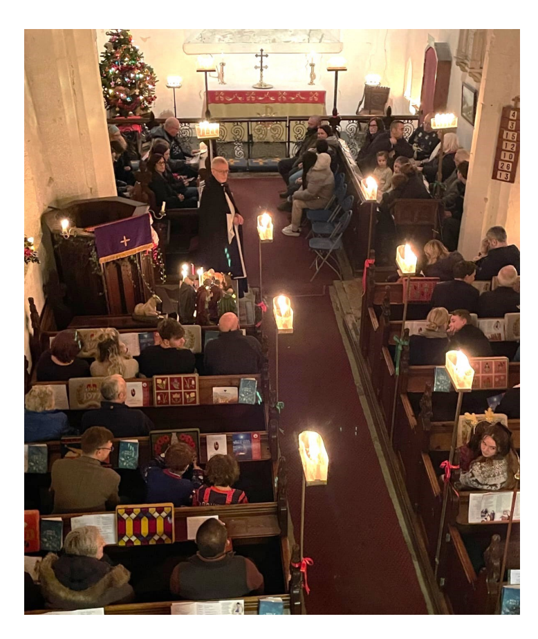
Candlelit Carol Service

The church is Grade 1 listed and dates from the 11th century. It is separated from the village by a dual carriageway but despite its isolated position it remains open in daylight hours. The church and churchyard provide a place for reflection for many of the villagers and we have been very encouraged by messages left by visitors from further afield as well.