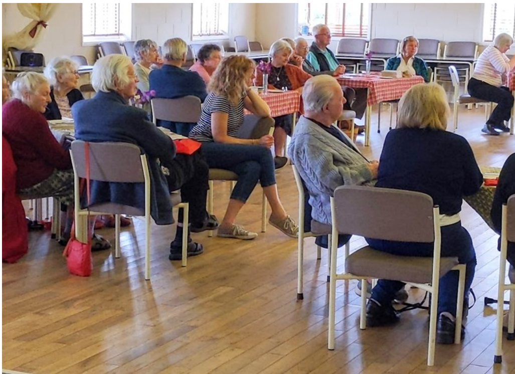
Soup and Service

Our churches are all Grade 1 or 2* listed. We have successfully risen to the challenge of modernising facilities, maintaining the fabric and making the buildings welcoming and well suited to our worship, at the same time as paying our full Parish Share. The church of St Mary the Virgin in Stonham Parva is in the care of the Churches Conservation Trust and occasional services are held there. Our churches are greatly valued by non-churchgoers as well as worshippers, and we are very keen to encourage people to come through our doors. Concerts, flower festivals and coffee mornings are well attended. We also reach out beyond the church buildings through our fortnightly Soup Lunches aimed at the 'retired' age group. These include a short act of worship and are regularly attended by 25 to 30.