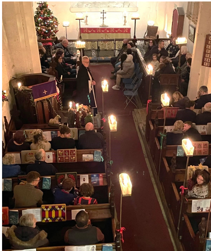
Candlelit Carol Service

The church is Grade 1 listed and dates from the 11th century. It is separated from the village by a dual carriageway but despite its isolated position it remains open in daylight hours. The church and churchyard provide a place for reflection for many of the villagers and we have been very encouraged by messages left by visitors from further afield as well.