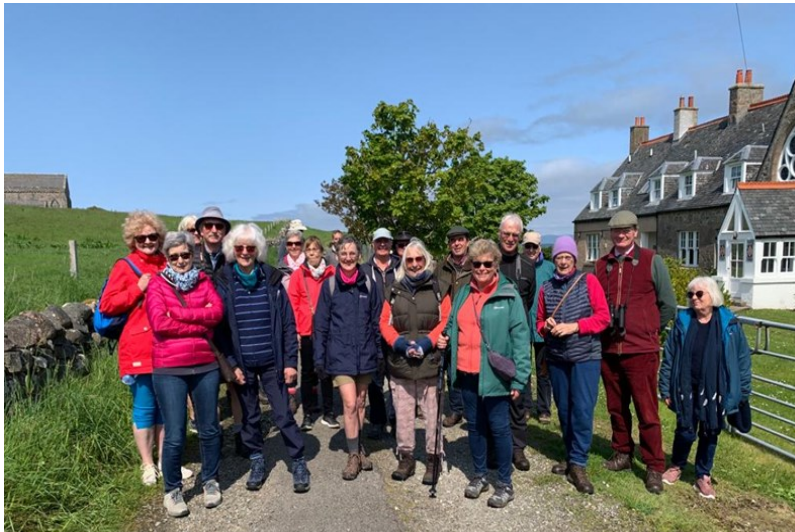
Benefice pilgrimage to Iona

Patterns of worship continue to evolve to balance needs, aspirations and resources and increasing numbers of worshippers travel across parish boundaries. Most churches have three services in a typical month, generally in Common Worship format with a few BCP services, and we join together for Holy Communion as a benefice when there is a fifth Sunday in the month. Individual parishes also combine on special occasions such as Palm Sunday, Good Friday and Rogation. A Band and a Choir draw members from across the parishes for benefice services, Christmas, Easter, Harvest Festival and Songs of Praise celebrations. Appendix 1 shows the basic monthly template for our worship in 2023. We are open to other forms of service (particularly those which might encourage higher attendance by families and children) and different monthly patterns. During 2023, 4 baptisms, 1 wedding and 20 funerals were held across the benefice.