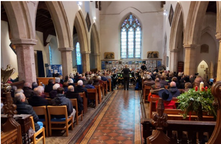
A brass band concert in Coddendam Church

The parish of Coddendam, with a population of just over 500, has a very friendly and active community. Villagers and others from the parish and beyond meet at the church, community-run village shop, country club and modern community centre as well as in the Mary Day Centre where there are twenty sheltered housing units centred on Haysel House, the former rectory. A monthly communion service is held in the meeting room there. Our dynamic Community Response Group works with the Parish Council for the benefit of parishioners and St. Mary's is very actively involved, including taking the lead in running a Baby and Toddlers group. A biennial Scarecrows and Open Gardens festival, workdays on communal areas and a wide range of other events all enhance our local community spirit.