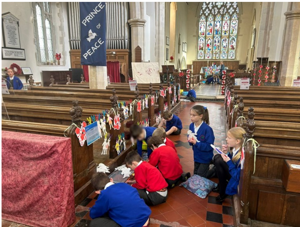
School children writing prayers during PraySpace, led by Bury Christian Youth

Our challenges are to increase regular worshippers, spread the workload over a larger congregation, aspire to the success of Mickfield Evangelical Church and Debenham Forge Community Church, increase support from Mickfield village and continue raising sufficient funds to pay the Parish Share in full.