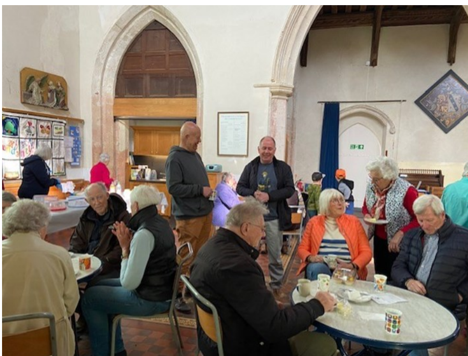
Coffee mornings are a focus of village life

The parish finances are in a good state. Contributions from regular donors by gift aid together with other offertory money is sufficient to pay day to day expenses, allowing all fund raising activities to raise money for the church fabric and for good causes. We are able to pay our Parish Share in full. Additionally, the Gardemau Church Charity provides investment income to be spent in the parish for the advancement of religion, the church fabric or in grants to the other Gardemau Charities for education and relief of the poor. We are currently making good progress with a campaign to raise £60,000 to fund masonry and window repairs.