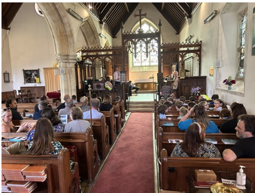
The school leavers' service

We have an excellent Church of England VAP school; staff, parents and children visit the Church for festivals and end of term services. Our Rector has a close working relationship with the school.