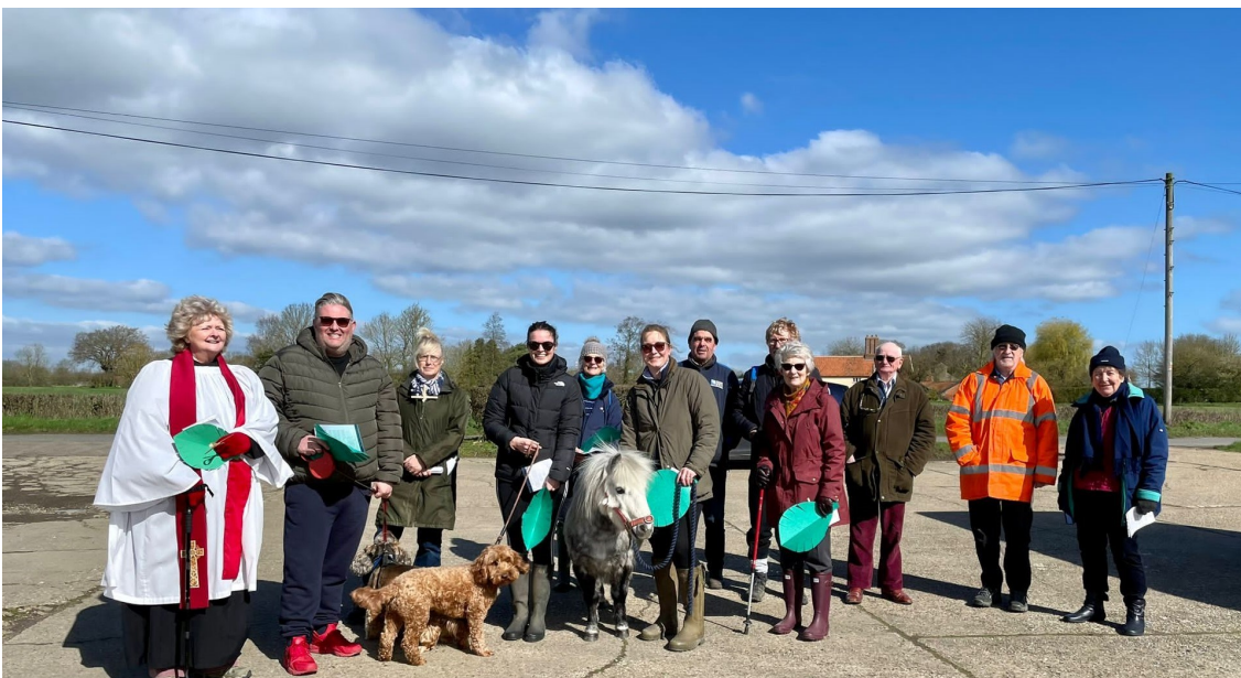
Palm Sunday - Walk and Worship

We share the diocesan Growing in God priorities. Within these we are especially keen to be Growing Younger: we wish to step up our engagement with children, young people and families so that we better reflect the age profile of our communities. We feel that working to bring children and younger adults to faith should be a top priority, especially given the presence of two church schools in the benefice. As a church we should reach out as much as possible to our communities in 'practical' as well as 'spiritual' ways and we are open to 'Fresh Expressions' of worship alongside our more traditional services. We seek to appoint a new incumbent who shares this vision.