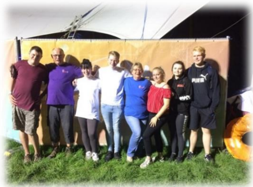
"Soul Survivors" 2019