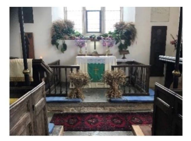
Our Festival Church: The Priory of St Mary, Letheringham