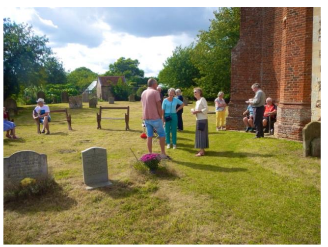
Refreshment in the sunshine St Andrew & St Eustachius, Hoo