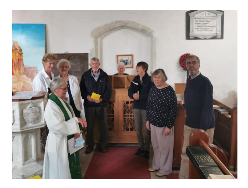
Conversation after a Service: St Peter's, Charsfield

Conversation after a Service: St Mary's, Monewden.