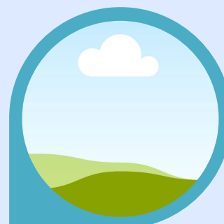
YOU? Director of Mission & Ministry