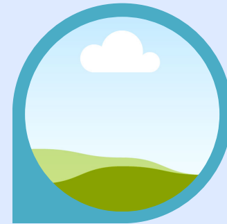
YOU? Director of Mission & Ministry