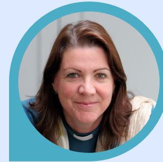
VEN RHIANNON KING Archdeacon of Ipswich