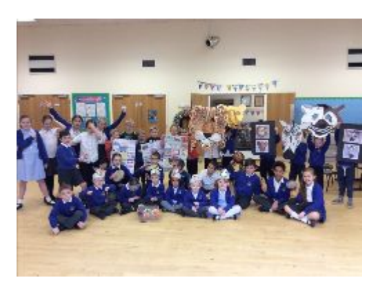
Photo: Kagera themed Day at Great Whelnetham CofE Primary The Diocese of St Edmundsbury and Ipswich has had a partnership with Kagera Diocese in Tanzania since 1994. For more, please visit our <u>website</u>.

We acknowledge that as your handiwork, we stand alongside all that you have made. Trees and rivers, mountains and valleys, soaring birds and scuttling creatures, all are held within your care. May we grow in our love and appreciation for the fabulous variety around us; and may our awe and wonder draw us closer to the natural world, and through it to you, the God of all things. We pray in Jesus name, Amen