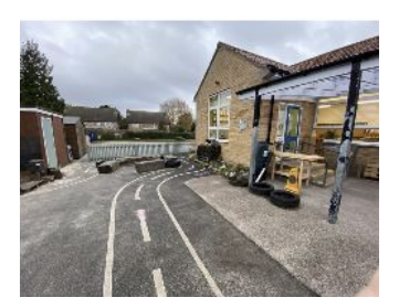
Barnham Outdoor area - before!

school's design and technology lesson as well as different features to encourage upper body strength.