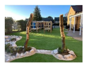
Barnham Outdoor area - after!