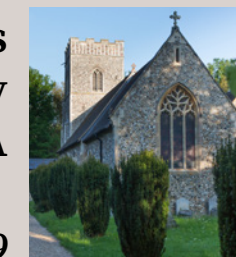
St Mary's Bentley IP9 2DA