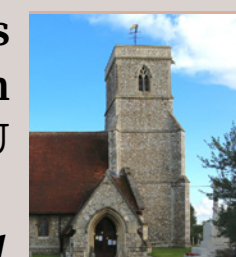
St Michael's Brantham CO11 1PU