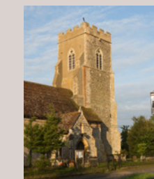
St Mary's Tattingstone IP9 2NA