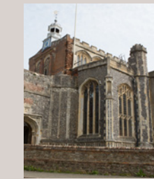
St Mary's East Bergholt CO7 6TG

L ocated in picturesque Constable Country, not far from the coast, between Colchester and Ipswich, with good links to London via the station at Manningtree or by road via the A12 and with equally good links north via the A14. We are a new grouping of four geographically close rural parishes who already have a strong history of working in partnership. Seeking to be actively involved in the local community, each of us has a lovely church building with good facilities or plans to obtain them.