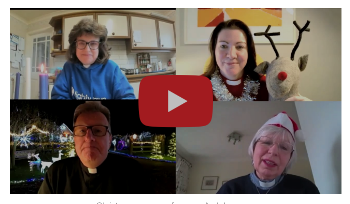
Christmas message from our Archdeacons.

Information and guidance for churches during the Covid-19 pandemic is being updated. Please visit the Church of England page <a href="here">here</a> and the Diocesan guidance page here for the most up to date information.