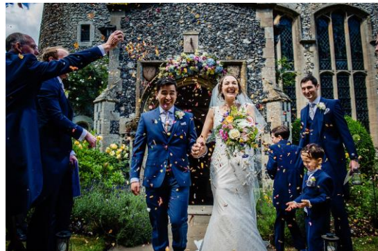
A wedding at nearby Hengrave

St Catherine's is the parish church for the villages of Flempton and Hengrave. It sits on the crossroads in Flempton and is the only community space in the village. The churchyard is managed for wildlife and is home to many wildflowers, insects, birds and snakes.