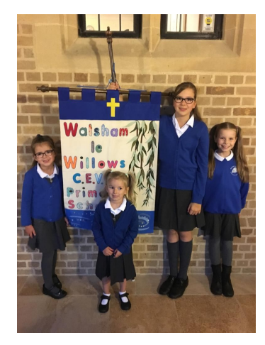
Photo: pupils from Walsham Le Willows CEVCP School with school banner