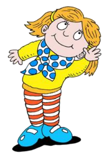
God speaks to us. if we take time to listen

You will find lots of interesting stories and suggestions on the Prayer Spaces in Schools website. Two are described below but it is really worth visiting the website and trawling the ideas. One particular idea is that every Prayer space should include an activity that is 'outward' facing and deals with an issue of justice in the world.