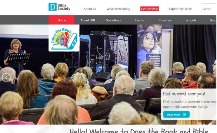
Hello! Welcome to Open the Book and Bible storytelling in primary schools.

https://www.biblesociety.org.uk/get-involved/open-thebook/?source_code=99012_openthebook.net