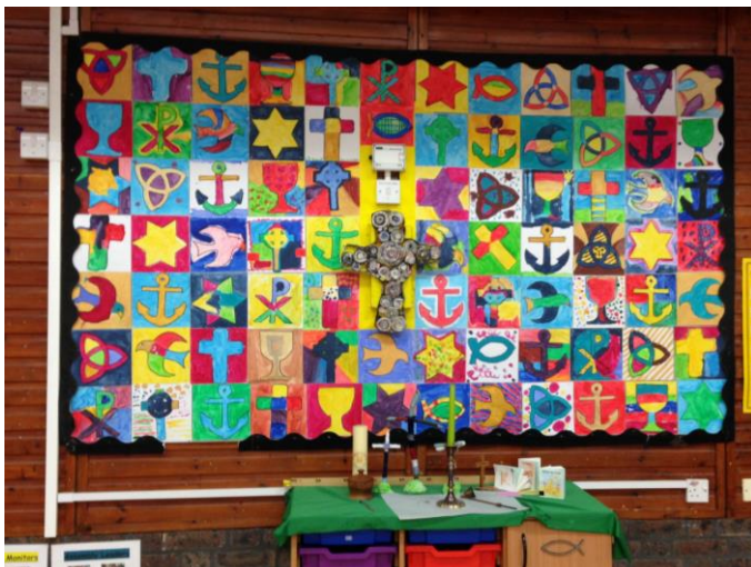
Images from Thurston, Hopton, Charsfield and Bentley Primary Schools – with thanks