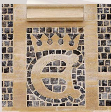
The Foundation logo is taken from the stone and flintwork E found on the Millennium Tower parapet