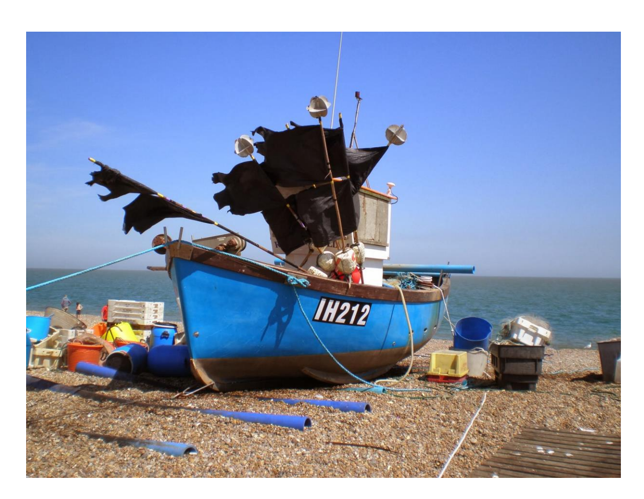
Fishing Boat at Aldeburgh

Challenging God, you come to us where we are and invite us to offer ourselves in your service: open our lives to your presence, and give us courage to live with your call.