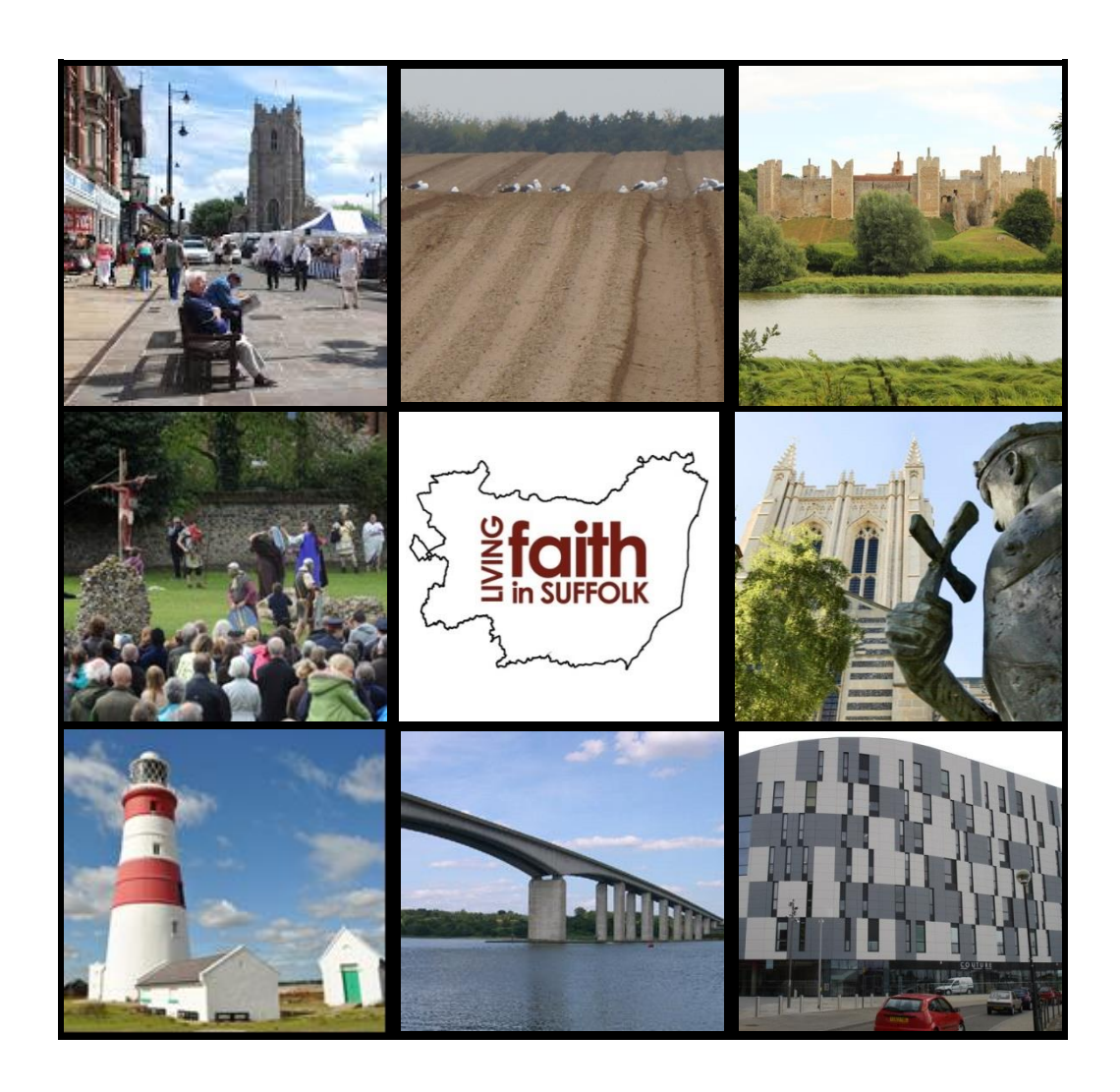
Living Luke 2