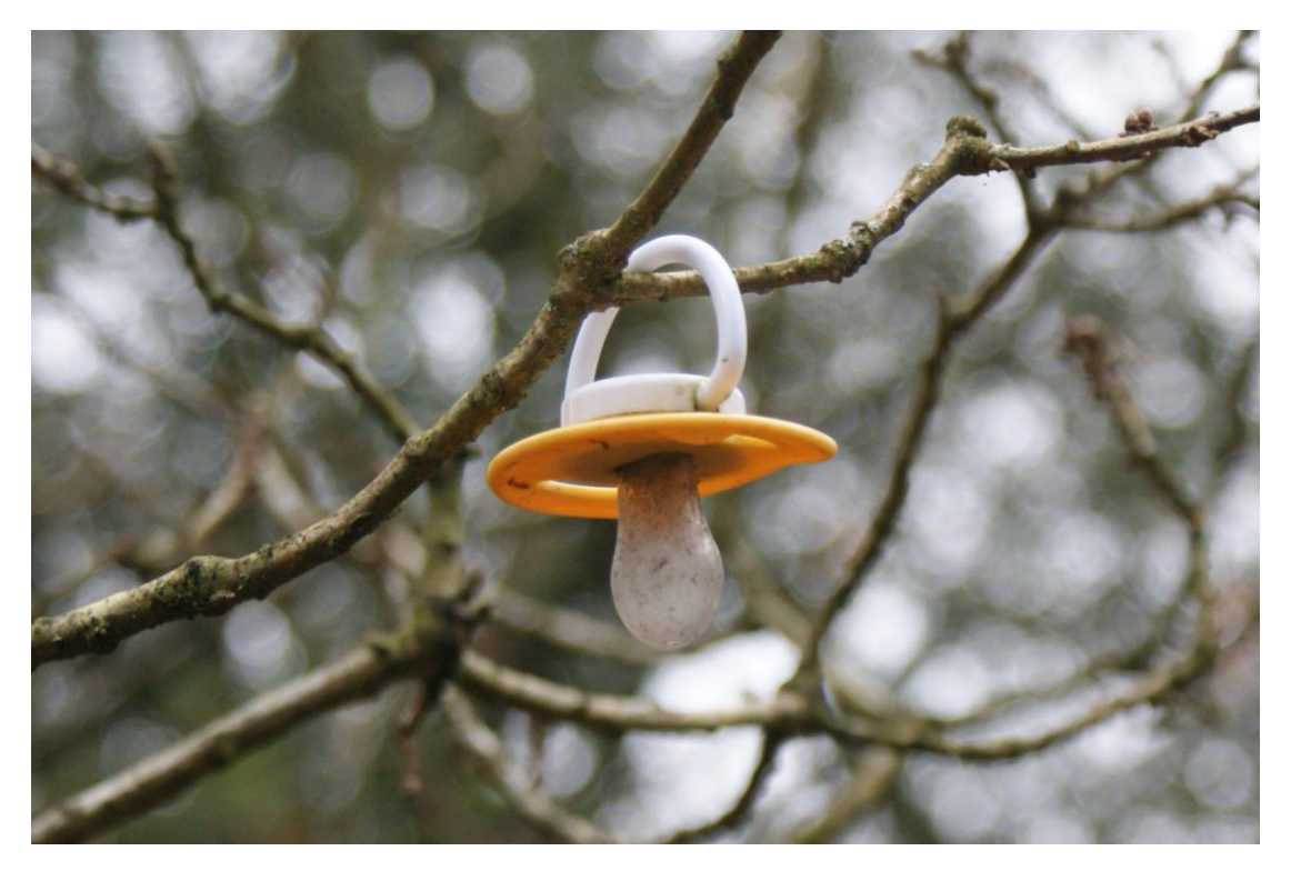
Out of place

Look carefully at the picture below, taken in the New Forest. Use it to help you to reflect on things being 'out of place'.