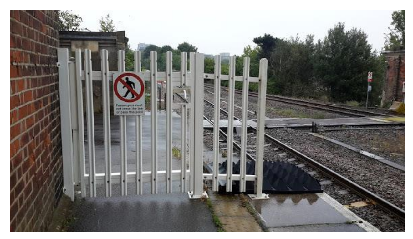
'Passengers must not cross the line or pass this point'