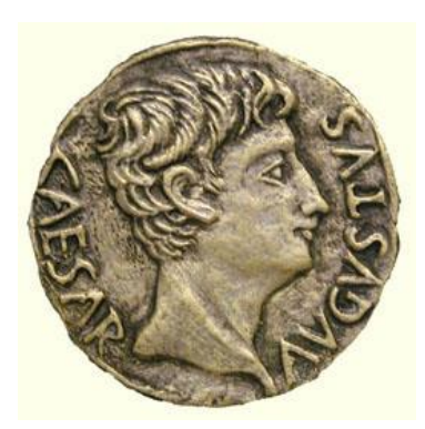
A Roman denarius, stamped with the emperor's head and a symbol of foreign rule, used for paying taxes to Rome.