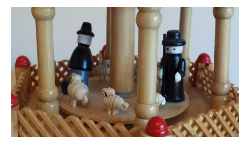
The middle tier has shepherds with their lambs, journeying in search of the new baby.