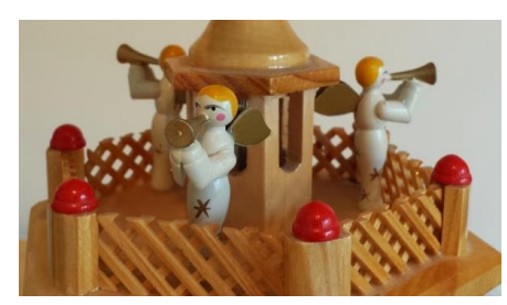
The top tier shows three angels trumpeting the good news of Jesus' birth.

This nativity scene has a strong sense of movement, of travelling. The heat from the candles makes the propellers at the top rotate, causing each of the tiers beneath to move around the central spindle.