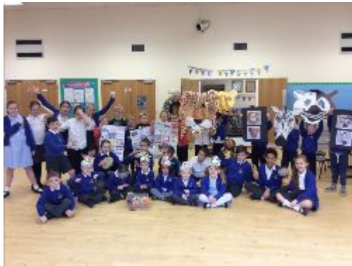
Photo: Kagera themed Day at Great Whelnetnam CofE Primary The Diocese of St Edmundsbury and Ipswich has had a partnership with Kagera Diocese in Tanzania since 1994. For more, please visit our website .

Creator God, We acknowledge that as your handiwork, we stand alongside all that you have made. Trees and rivers, mountains and valleys, soaring birds and scuttling creatures, all are held within your care. May we grow in our love and appreciation for the fabulous variety around us; and may our awe and wonder draw us closer to the natural world, and through it to you, the God of all things. We pray in Jesus name, Amen