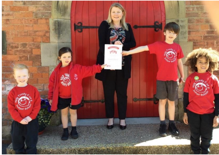
Holy Trinity CE Infant School, Southwell Bronze Global Neighbours award holders

the world, which can be transformative for all involved as we ‘tap into’ God’s reality and his vision for the future of his world where justice and mercy will reign.