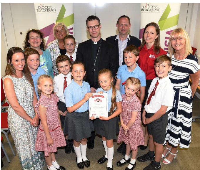
The first two schools in the country to achieve Global Neighbours Bronze Awards: Wilson’s Endowed CE Primary School and Whittle-le-Woods CE Primary School

As educators we must consider how to channel this righteous ‘table turning’ anger in constructive ways that harness the energy of youth but never patronise or put limits on their passion.