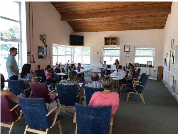
St Luke's CE Primary School, Sway Global Neighbours Gold award holders: Sway Parish Junior Council meeting.

From St Luke's CE Primary School, Sway , Global Neighbours Gold Assessment